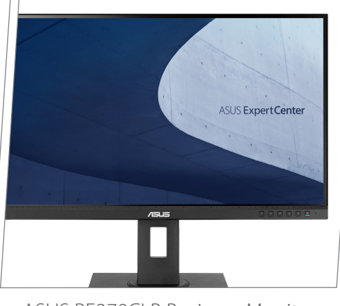
ASUS BE279CLB Business Monitor