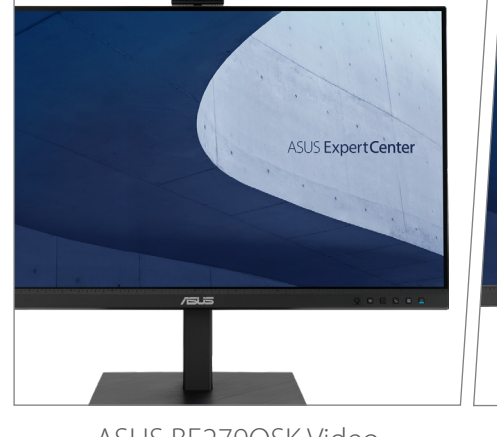
ASUS BE279QSK Video Conferencing Monitor