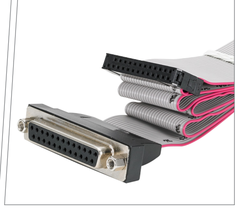
ASUS Parallel Port Cable